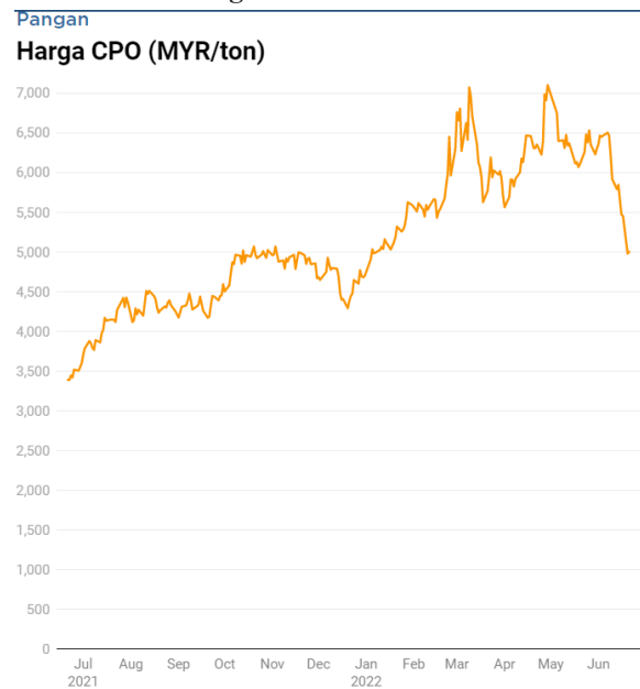
Figure 2. CPO Price

Chart: Annisa Alfaha • Source: Refinitiv