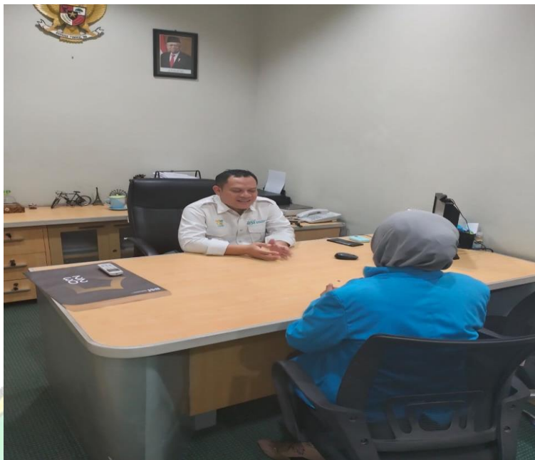
Ket. Wawancara kepada Branch Manager BSI KCP Morowali