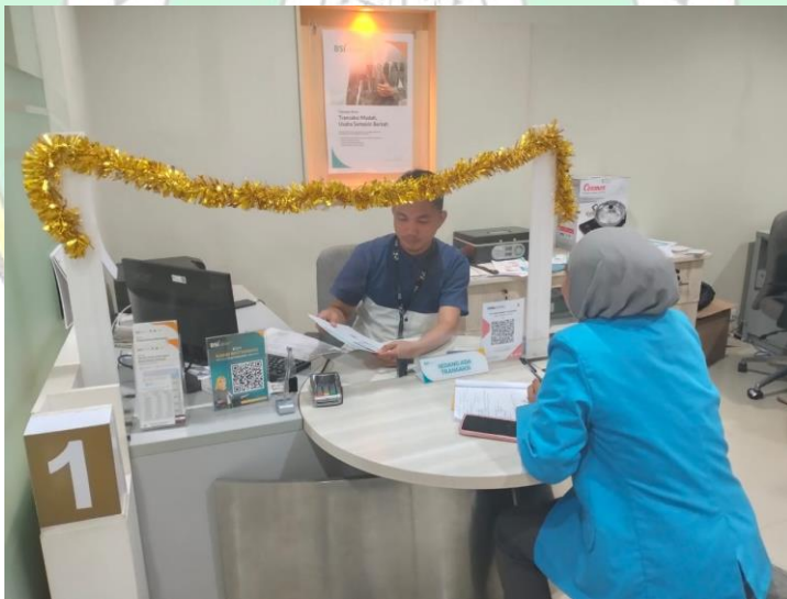
Ket. Wawancara kepada staf RSE