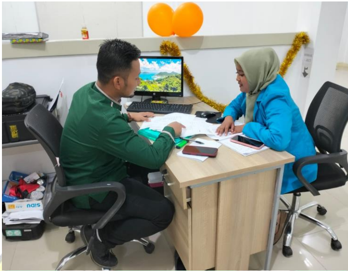
Ket. Wawancara kepada mikro staf